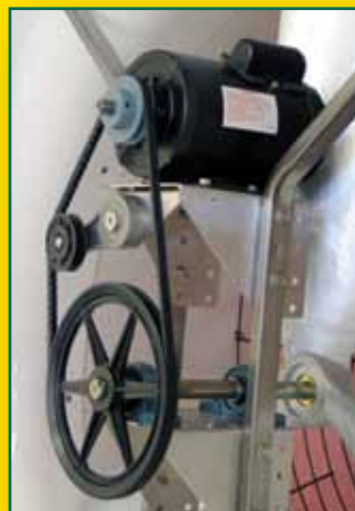
Motor mount and drive assembly utilize a rugged box frame design to increase motor life.

The tested and proven designs of VAL-CO® deliver superior performance and value.